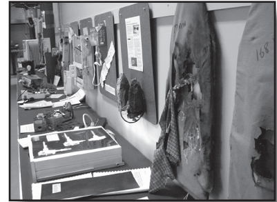
Displayed artifacts recovered from actual fire scenes or preserved from testing illustrate instructors’ lessons.