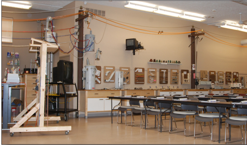
Figure 1. What would a seminar about electricity be without utility poles? Fire Findings' laboratory setting allows for full-scale and elaborate displays of a wide variety of components you encounter every day.

These are a few photos from our course, "Residential Electricity for Fire Investigators."