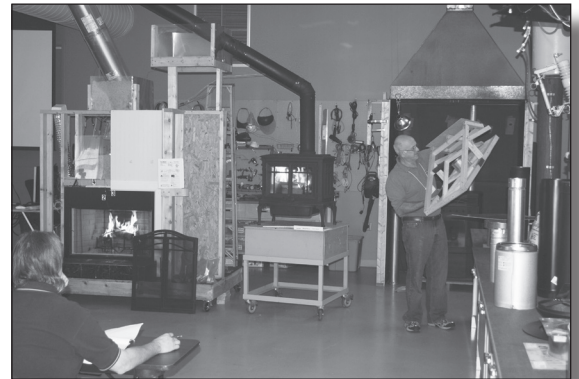
A fireplace and wood-burning stove operate with real-time temperature recording so you can see how varying conditions can affect temperatures inside the appliances and on the exteriors of their chimneys or chimney connectors. Mockups of roof structures illustrate how and why chimneys are installed improperly and cause fires.

Optional test credits toward CFI certification are available, along with continuing education credits.